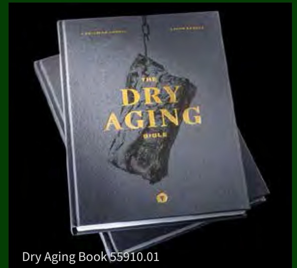
Dry Aging Book 55910.01