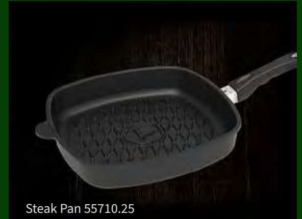
Steak Pan 55710.25