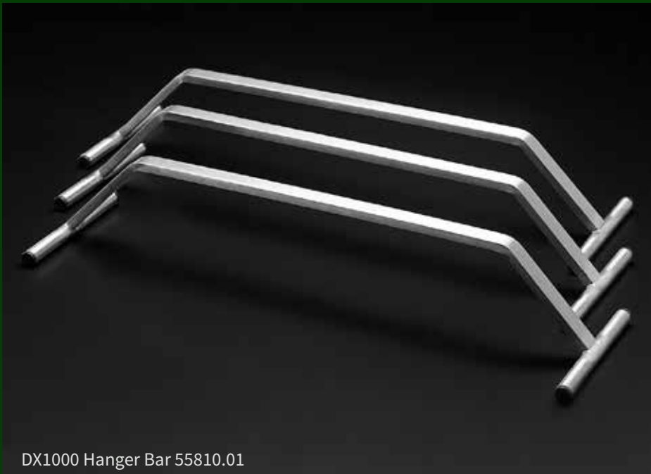
DX1000 Hanger Bar 55810.01