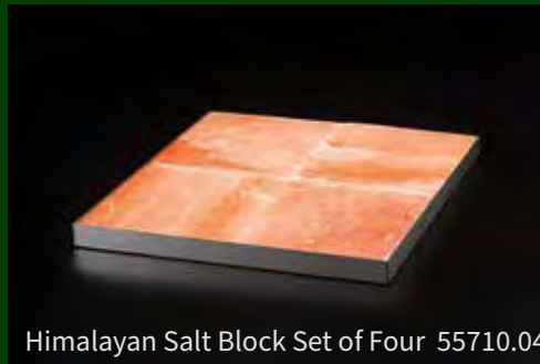
Himalayan Salt Block Set of Four 55710.04