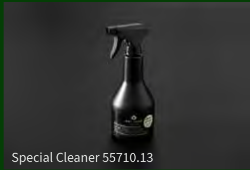
Special Cleaner 55710.13