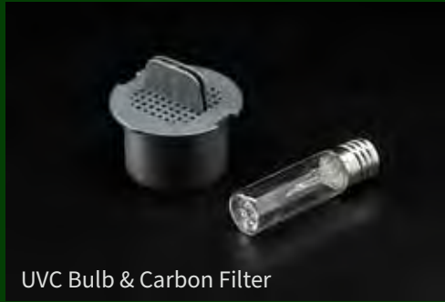
UVC Bulb & Carbon Filter