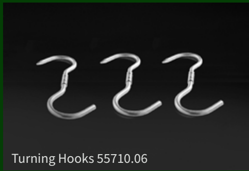
Turning Hooks 55710.06