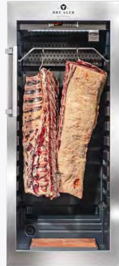
Stainless Steel Model Pictured